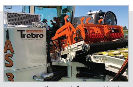
New powered roll-up system with on-the-go automatic flap positioning.